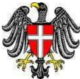
Coat of arms of Vienna